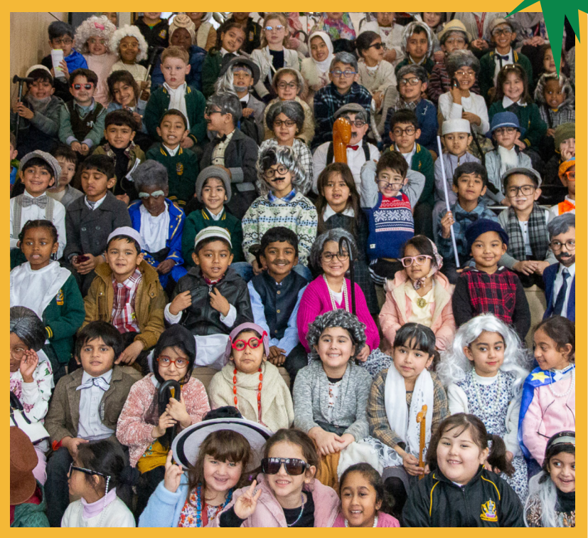
Across our three campuses, students, parents and teachers celebrated a significant milestone for our Foundation students – 100 days of Foundation! From those initial moments of hesitation and uncertainty, they have blossomed into confident learners, eager to explore new horizons.